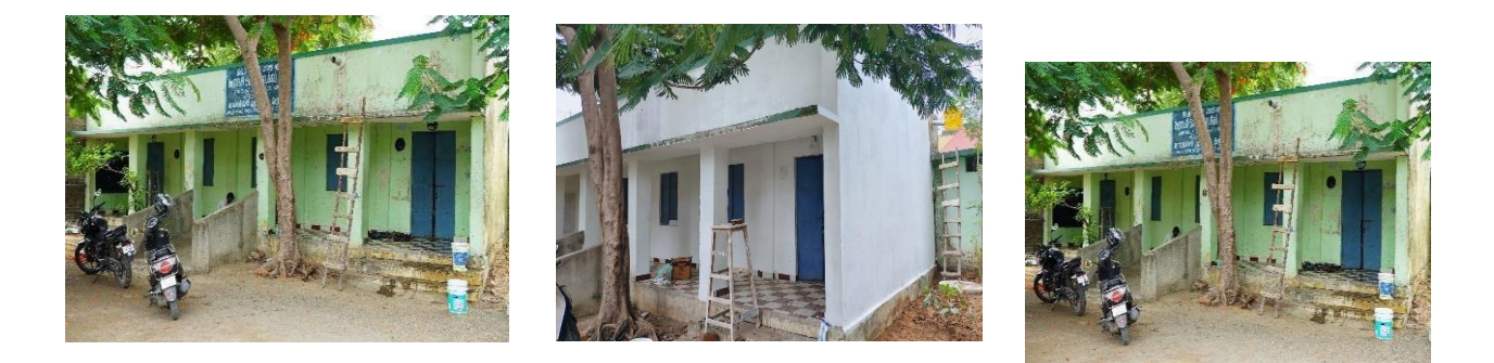
AFTER Renovation of Schoo